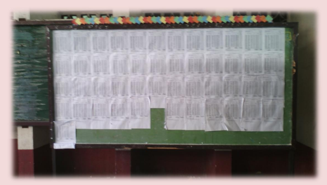
This was the sample of list of test takers were learners from different schools checked their names to noticed where there designated rooms.