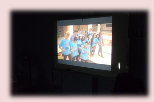
Shared thoughts of the learners during the final coaching program