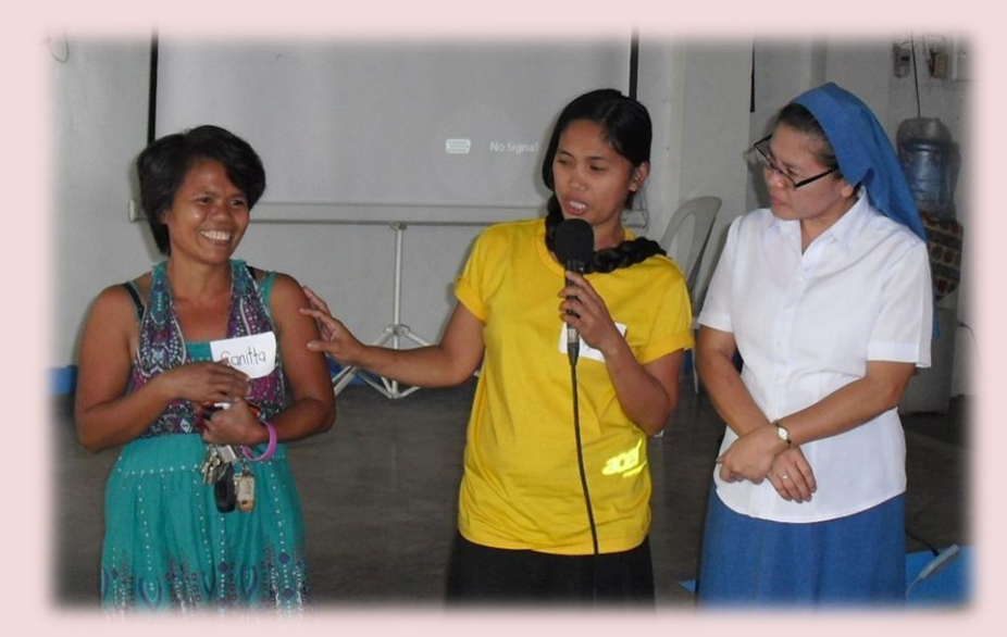
Participants introduced and mentioned what they like about the other