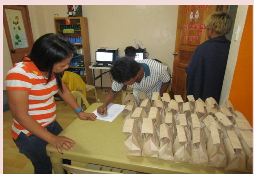
Distribution of lunch meals