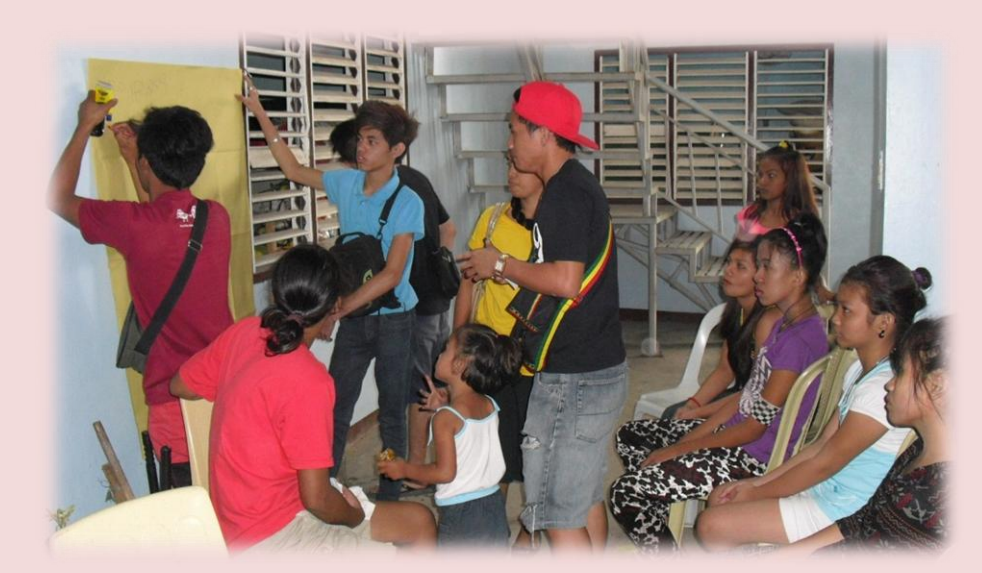
Learners identified and wrote down their unmet rights