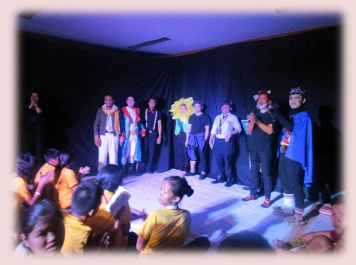
The casts of the play after their performance