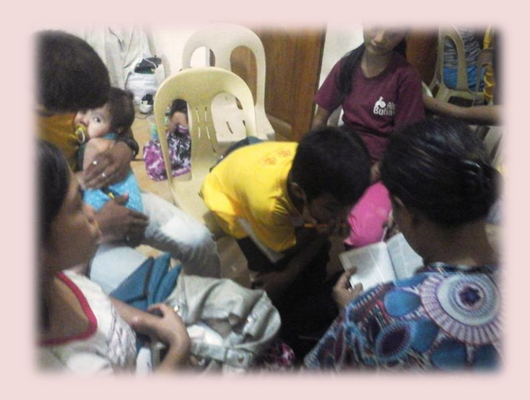
Learners having their group activity and sharing

This Lenten recollection helped the learners and staffs to recall the goodness of Christ and make it significant by continue doing good things, living with faith and love of God and fellowmen.