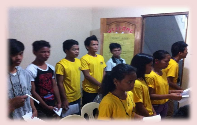
Selected learners who involved in choir group while singing Eagles Wing.