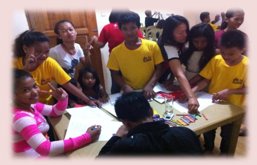
Learners workshop during the beginning of the session where they write their name in a piece of paper in their own desired designs, and shared it to the group while justifying if they want their given names or they want to change it to new one.