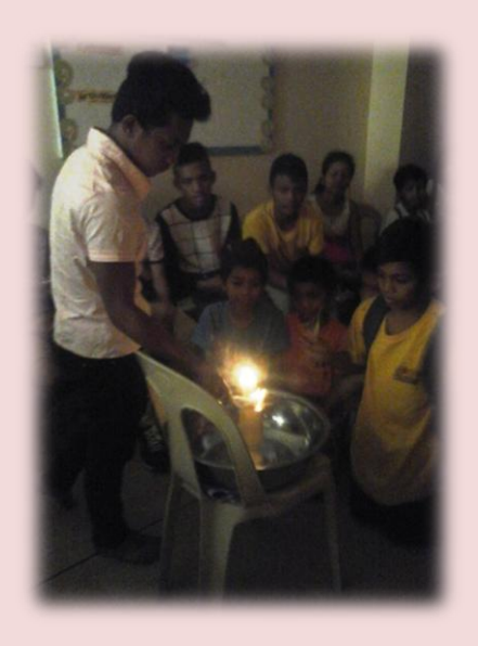
During the closing activity