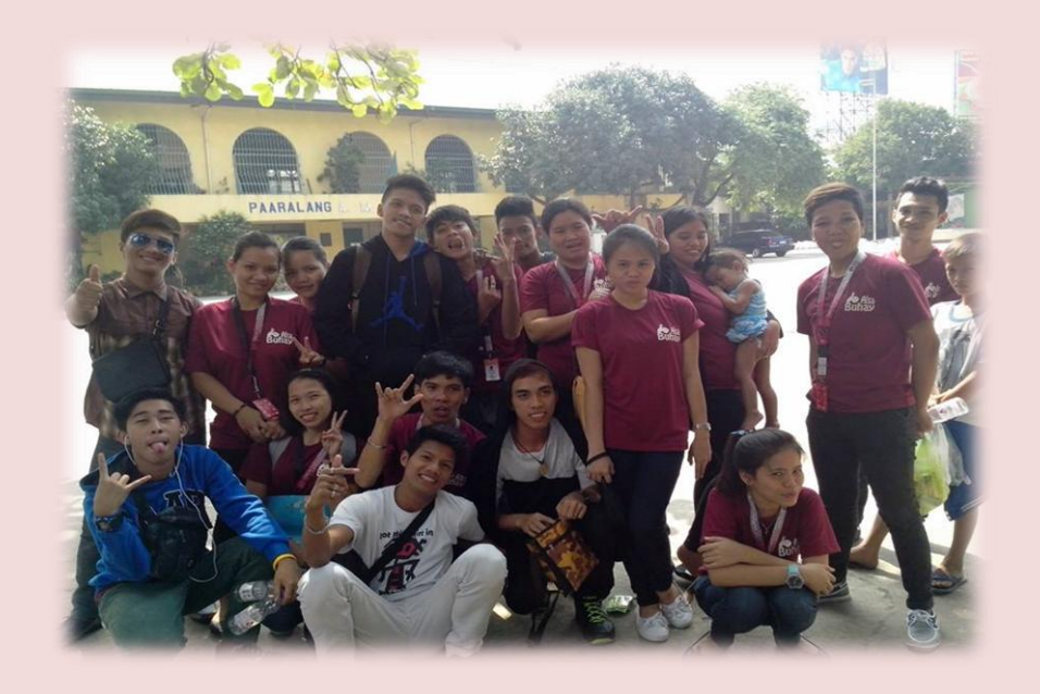
Secondary learners felt relaxed after the examination