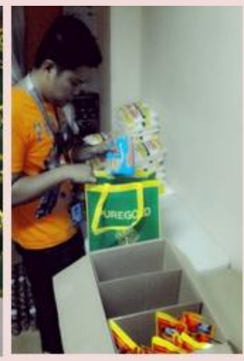
Repacking of Relief Goods