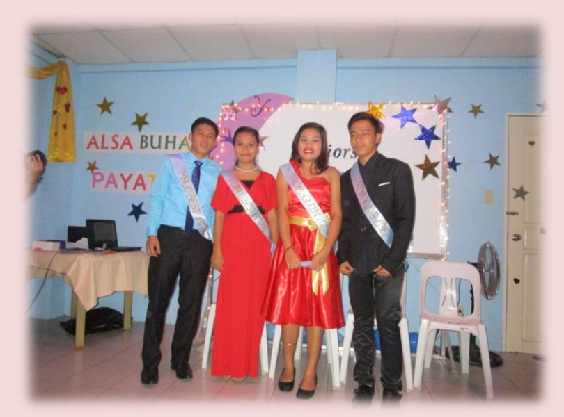
Best in Male and Female Attire, and Prom King and Queen