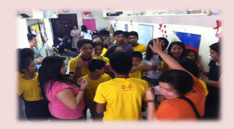
Learners enjoyed so much one of the game Pinoy henyo.