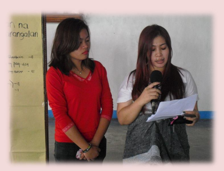
Parents engaged during the workshop & sharing of experiences to the big group