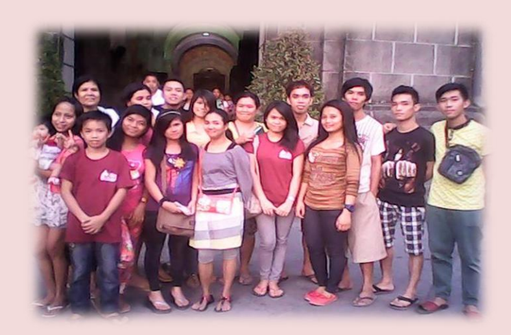
Learners feeling blessed and optimistic after the mass.