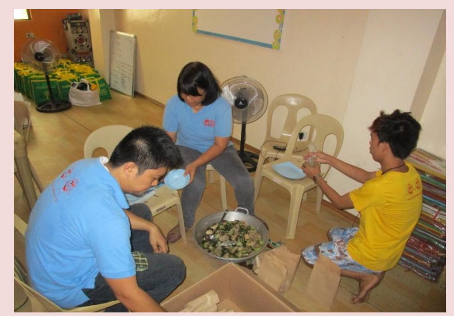
Photos while repacking of Lunch Meal with 4<sup>th</sup> batch volunteer Learner