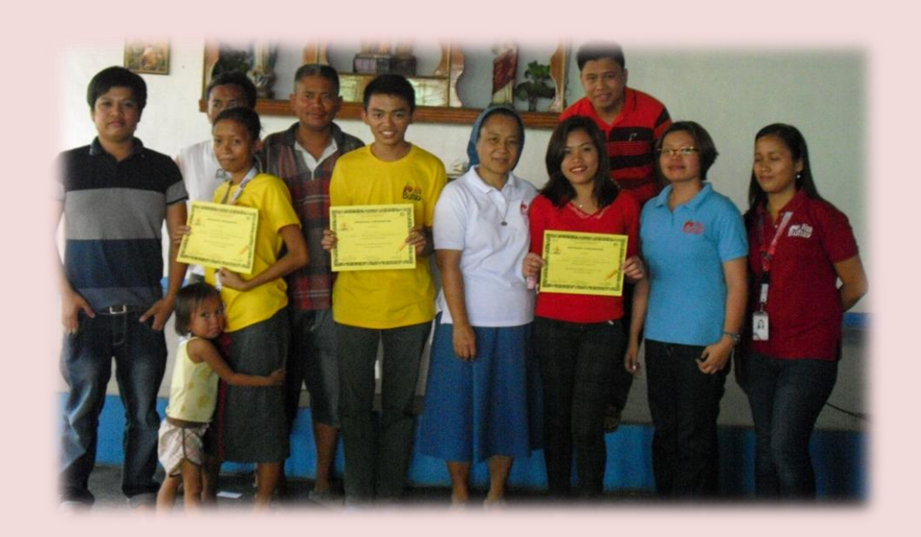
Elementary and Secondary Learners (with their guardians) of 3rd Batch awarded with certificates for their outstanding perfomances for the First Grading Period