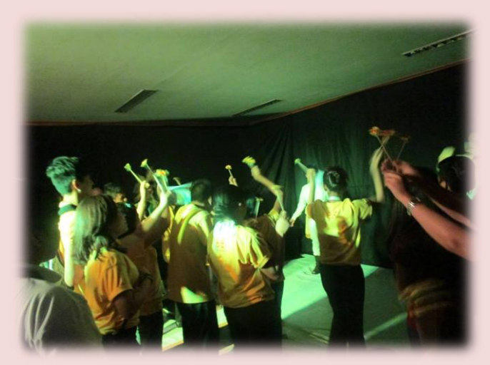
Audience became part of the play as the roses in the garden