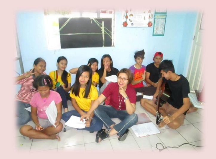
ALSA-Buhay Payatas Choir