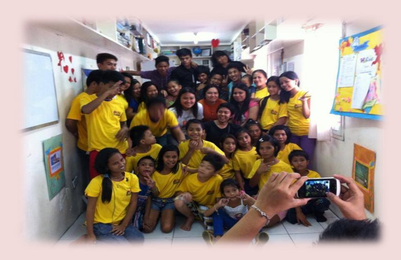
Group photo of Learners and Super Friends after the events, all are happy and blessed.