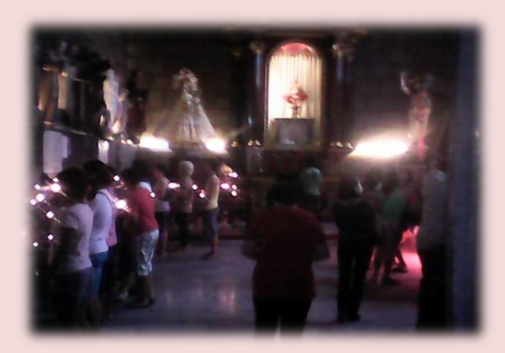
Learners offering prayers and wishes to God

We also brought them in the prayer area where they offered their personal prayer to God intimately. We went home blessed and full of hope for our life.